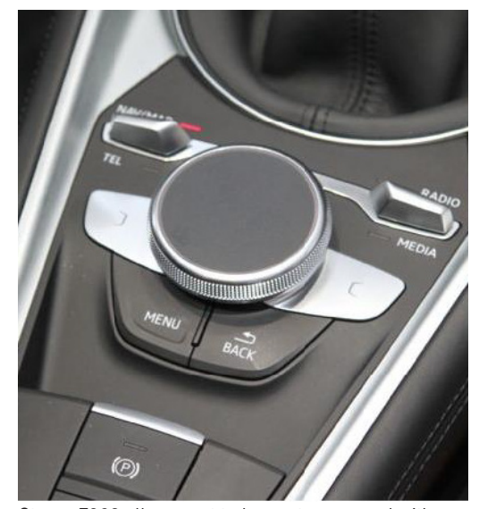
Stoner E302 allows part to be post processed with no further cleaning.