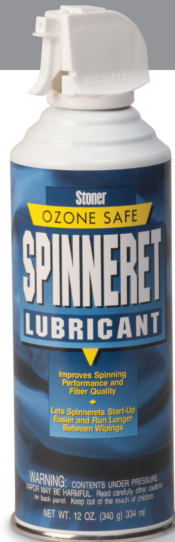
Item # S261

Melted Fibre Opportunity: Manufacturers of recycled plastic fibre, seatbelt fibre, tire cord, air bag fibre, and textile fibre.