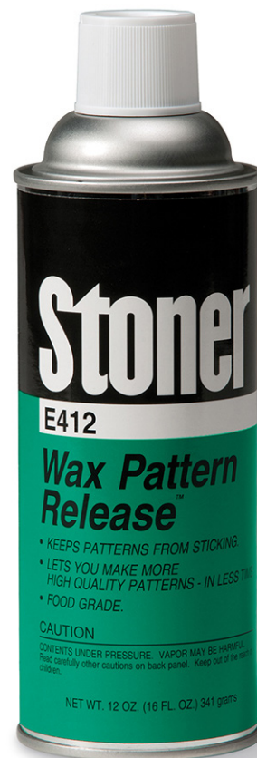
Item # E412

Investment casting molders worldwide find Stoner's unique ability to formulate and manufacture helps them save time and money. A consistent and reliable spray pattern ensures part-to-part integrity - more high quality patterns in less time.